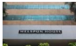
Tata Sons may put Welspun deal under lens due to concerns over corporate governance