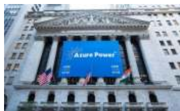
Azure Power commissions 100 MW NTPC solar project in AP