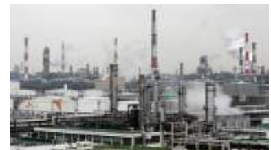
IOC, BPCL, HPCL sign agreement to set up $40 billion refinery