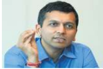
Despite Brexit woes, Lodha Group upbeat on London projects