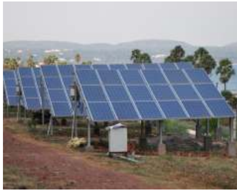
Bidders raise concerns over NTPC's Andaman storage-linked solar project