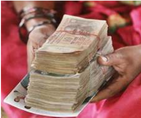
Bharat Financial to set up 2 lakh customer service points