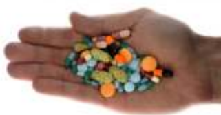
Glenmark gets USFDA nod for Saxagliptin tablets