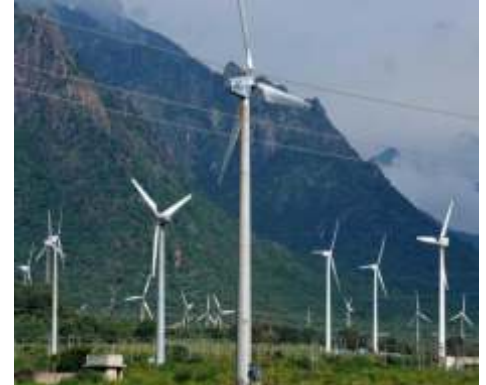
Crisil reaffirms 'AA-' rating for Inox Wind's long-term bank facilities