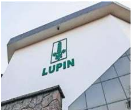
Lupin gets USFDA nod for opioid analgesic tablets