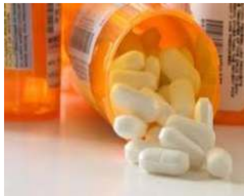
Dr Reddy's recalls 3.25 l cartons of Cipla-made acne drug from US